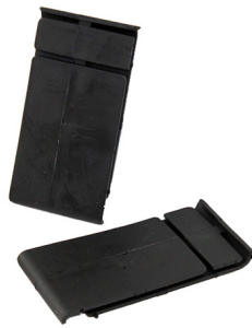
C08PFJIBL Standard Internal Jointer