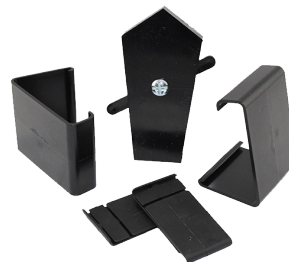
C08PFBL Complete Pack