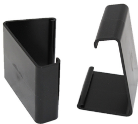
C08PJEBL External Jointer