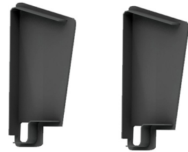
C08PFEBL Standard End Cap