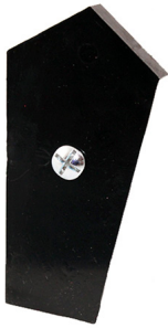
C08PFABL Apex Jointer